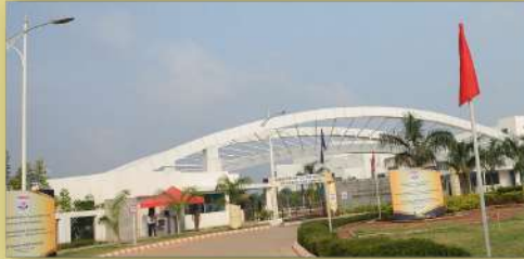
HPCL Green R & D Centre