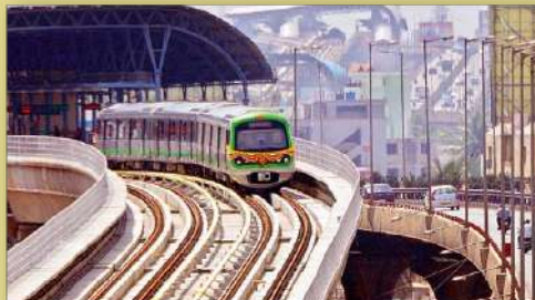
Metro Station, HOPE Farm, Whitefield