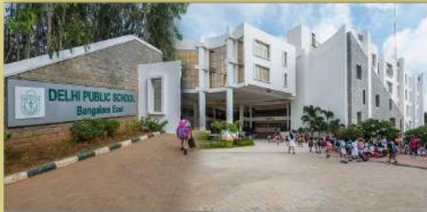
Delhi Public School, East, Whitefield